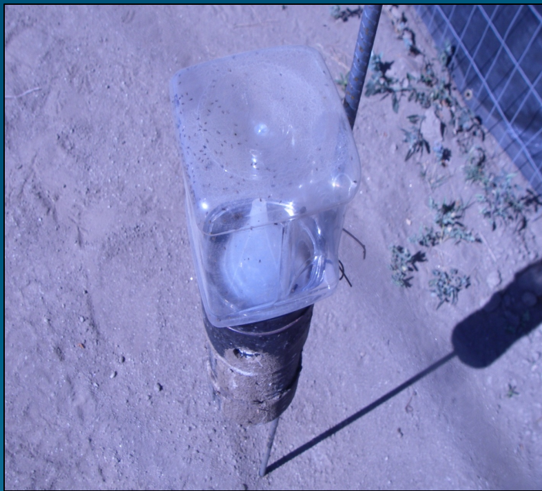
Eye Gnat Trap