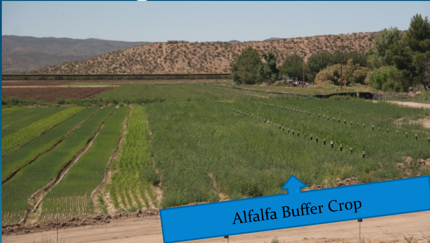
Alfalfa Buffer Crop

Buffer Crops on outer edge of farm (100 feet) – treated with conventional pesticides