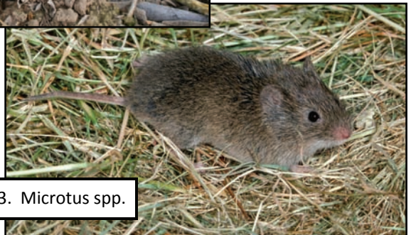
Figure 3. Microtus spp.