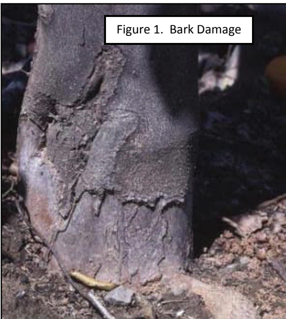
Figure 1. Bark Damage