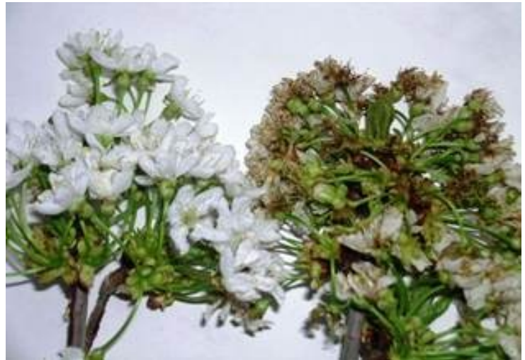
Good flowers on left, damaged flowers on right.

This pest is not yet found in the United States. However, this is an example of a pest that could be very destructive to many different California crops. In this case, though, we already have a potential method for control.