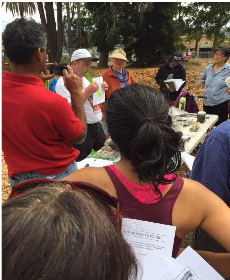
Caption: Workshop at the Gill Tract

Supported by County Agriculture Departments!