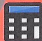
Easy to Use Water and Energy Savings Calculators

Find FREE Technical Application Submission Assistance is available in your area by visiting our website