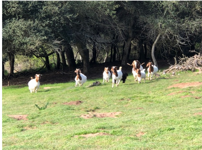
March 2019 Property 1, Field 2, plot C2.

This is a companion article to the Costs of Compost Addition article about the same project.