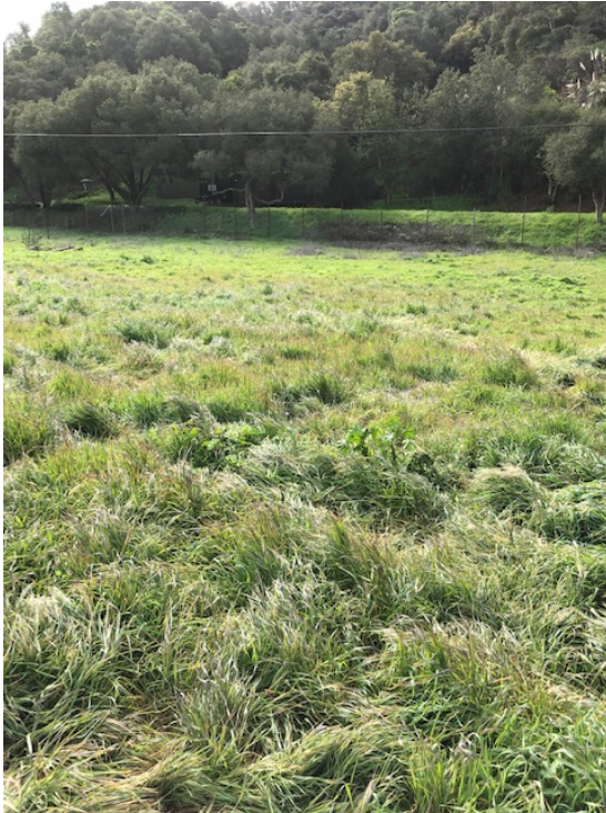
March 2019 Property 1, Field 1, plot T3.